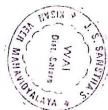
Head Department of Chemistry Kisan Veer Mahavidyalaya, Wai